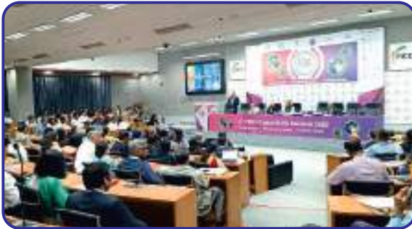
Participants at 14 th Global Skill Summit