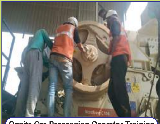
Onsite Ore Processing Operator Training

Courses We Offer Under PMKVY -We offer training under PMKVY Scheme in all job roles of SCMS