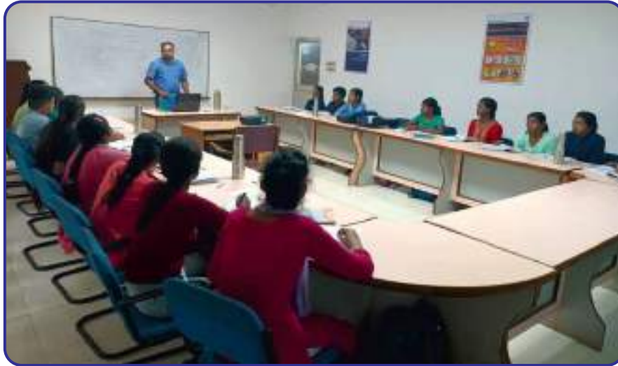
Glimpse of Classroom Training