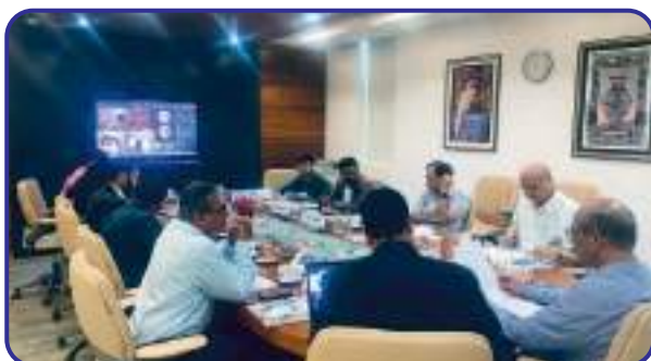
AGM in progress

The AGM discussed and approved the Annual Report, Appointment of Auditors, Audited Balance Sheet and Income and Expenditure Statement of the Skill Council for Mining Sector for the year 2022-2023.