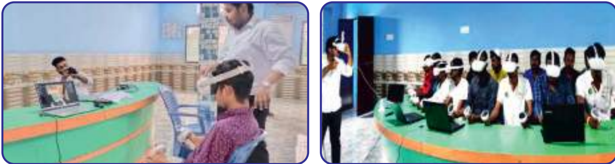
Trainee experiencing “Virtual Reality Training for “HEMM Equipment”

SCMS had signed an MoU with DMF Jajpur, Odisha on 15 th September 2022 for the Short Term Training of 210 candidates and RPL of 1000 candidates in the mining-affected regions in the district. The Short Term Training for 210 candidates and Upskilling/Reskilling of 1002 candidates are completed and the candidates are undergoing placements. As of now, 148 candidates of Short Term Training batches have been successfully placed against a total placement target of 147. SCMS has initiated Virtual Reality Training in this project for HEMM Equipment.