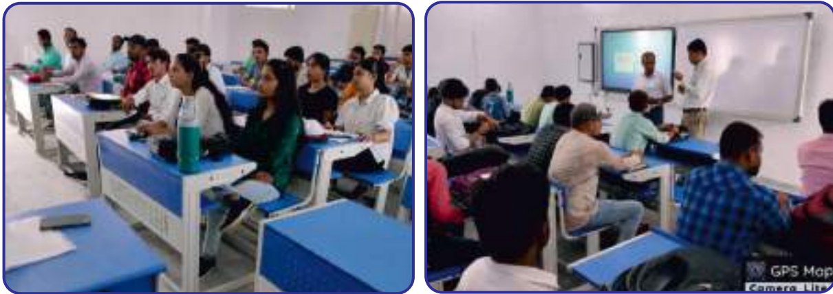
Glimpses of Classroom Training

connectivity and inclusion of marginalised sections of the society. SANKALP was launched on 19th January 2018 and has a tenure till March 2023.