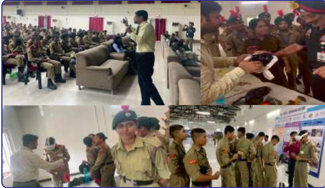
Glimpses from the event

The cadets also experienced the effects and utilities of VR Content developed for HEMM equipment like Excavator in the exhibition stall laid by SCMS which received very encouraging responses from the cadets.