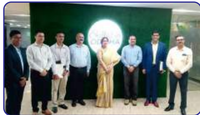
MOU - SCMS & Odisha Govt.