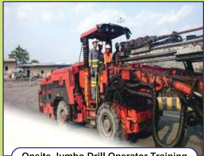
Onsite Jumbo Drill Operator Training

IISD Indian Institute of Skill Development