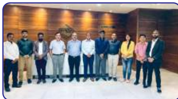
Group photograph with SCMS chairman