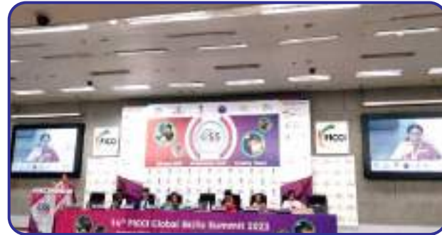
Dignitaries on Dias