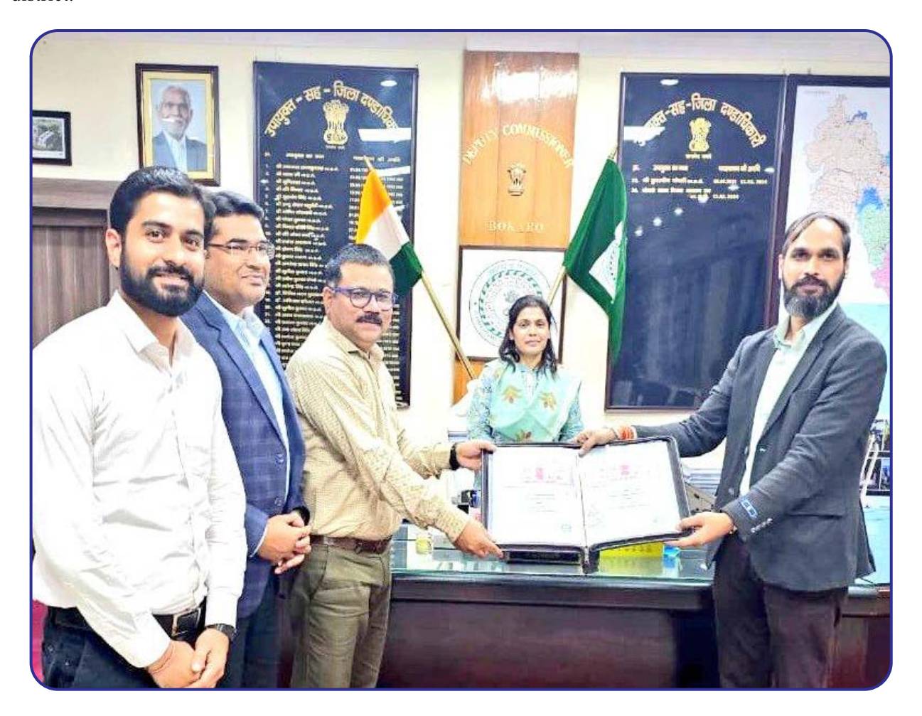
MOU signing between SCMS & DMFT, Bokaro

This project aims to empower the PAPs to earn livelihood in the mining sector and also create a pool of skilled mining workforce in the district which will help the current and upcoming mining companies in the district.