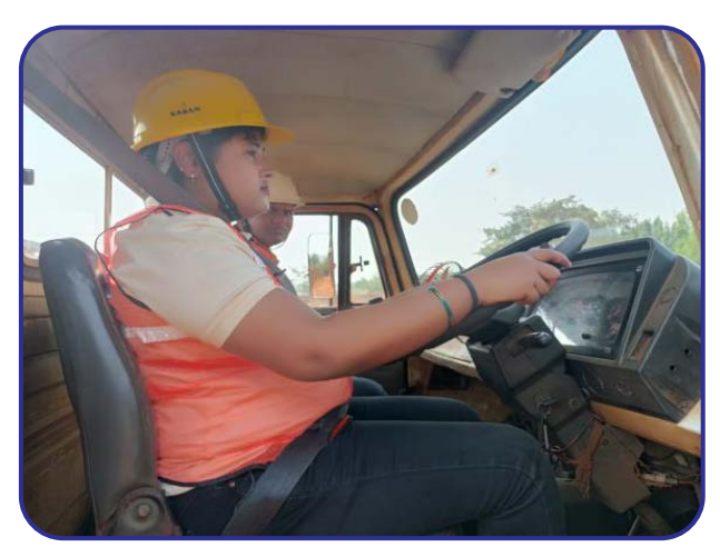
Apprenticeship Training at Sukinda Chromite Mines, Tata Steel Ltd.