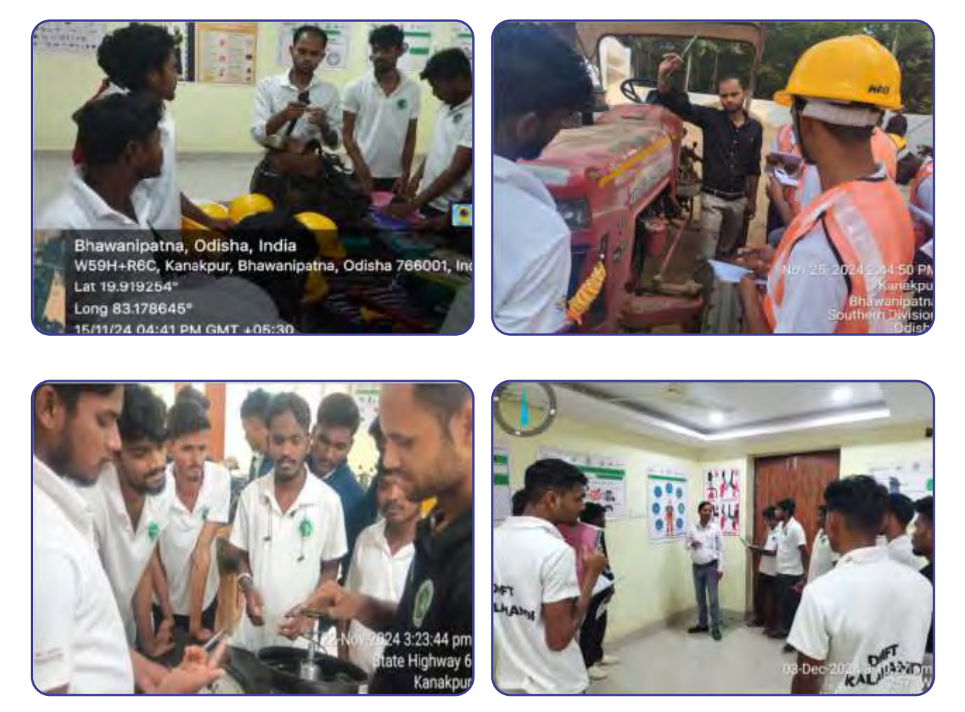
Glimpses of Training

Capacity Building Workshop on the Skill India Digital Hub Functionalities