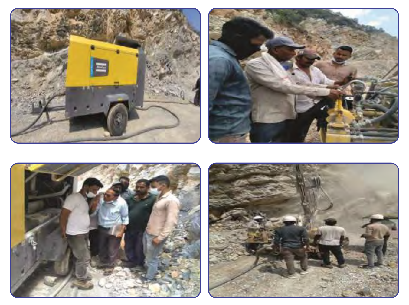
Glimpse of Training at Almora Magnesite

The training program was meticulously designed and imparted on comprehensive knowledge and handson skills related to wagon drilling techniques. Trainees have gained insights into the latest advancements in drilling technologies and safety protocols and also ensured they are equipped to perform their duties with utmost proficiency and safety.