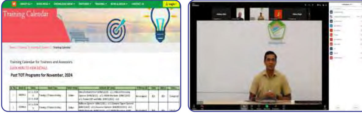
Training calendar published on SCMS website

SCMS carried out multiple ToT and ToA programs in Quarter-3, FY 2024-25 on the job roles of Bulldozer Operator, Dumper Operator, Loader Operator, HEMM Mechanic, Mechanic/Fitter, Mine Electrician, Mine Welder etc. In total 13 trainer certifications were issued.