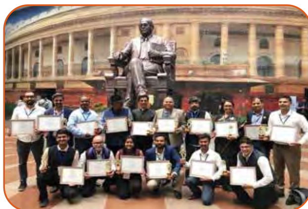
Trainers who trained Team India for WorldSkills-2019