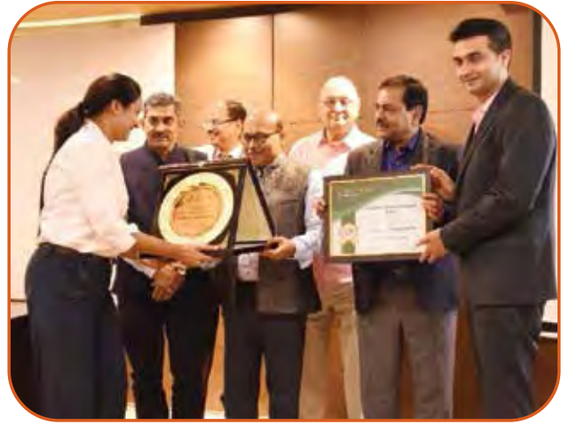
स्किल मंत्रा एडुटेक कंसल्टि इंडिया प्रा. लिमिटेड के प्रतिनिधि सर्वश्रेष्ठ मूल्यांकन एजेंसी 2018-19 का पुरस्कार ग्रहण करते हुए