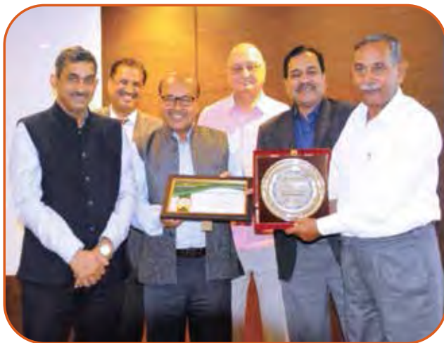
Trainer & Assessor receiving the award