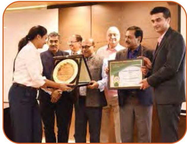
Skills Mantra Edutech Consulting India Pvt. Ltd receiving the award as Best Assessment Agency 2018-19