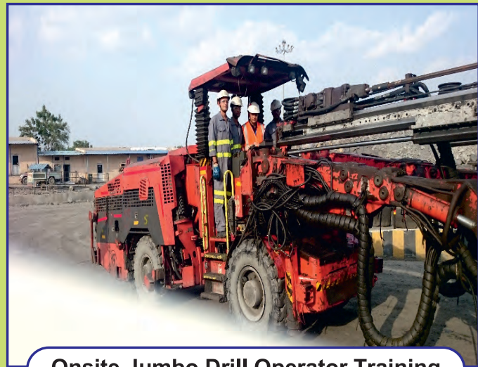
Onsite Jumbo Drill Operator Training

IISD Indian Institute of Skill Development