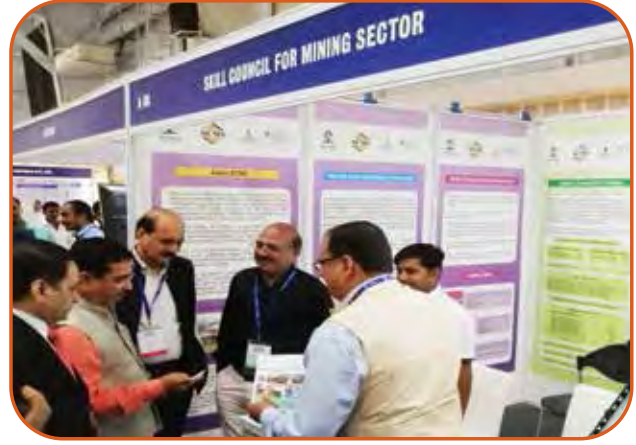
श्री प्रहलाद जोशी, माननीय खनन एवं कोयला तथा संसदीय कार्य मंत्री, खनन मजमा 2019 में एससीएमएस के स्टॉल में पधारते हुए