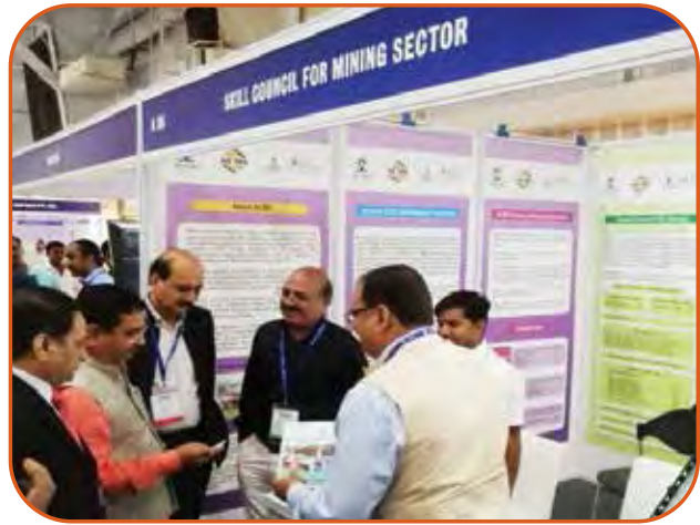
Shri Pralhad Joshi, Hon'ble Minister of Mines, Coal and Parliamentary Affairs, visited SCMS stall at Mining Mazma 2019