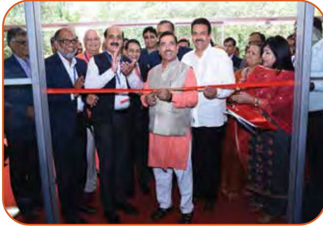
श्री प्रहलाद जोशी, माननीय खनन एवं कोयला तथा संसदीय कार्य मंत्री, सम्मेलन एवं व्यापार प्रदर्शनी का उद्घाटन करते हुए