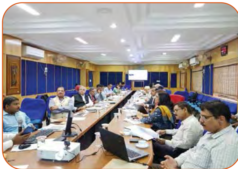
Workshop at Central Staff Training and Research Institute

Central Staff Training and Research Institute (CSTARI), Kolkata is an organization under Ministry of Skill Development and Entrepreneurship (MSDE). CSTARI develops outcome based curricula aligned to NSQF for various flagship schemes of DGT. To enable the SSC-ecosystem to leverage CSTARI, a visit by SSC-CEOs to CSTARI-Kolkata was organised by NSDC to understand their capability and offerings, and leverage CSTARI in the development of QP-NOS and curriculum. The workshop showcased the Curriculum development process and highlighted the capability of CSTARI on leveraging the SSC – Subject Matter Expert (SME) ecosystem for rapid development of QPs/NOSs.