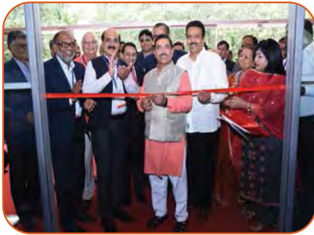
The Convention and Trade Show inaugurated by Shri Pralhad Joshi, Hon'ble Minister of Mines, Coal and Parliamentary Affairs