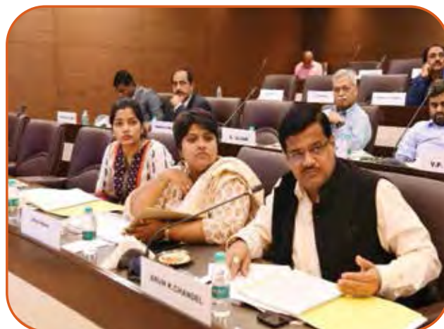
शासी बोर्ड की बैठक