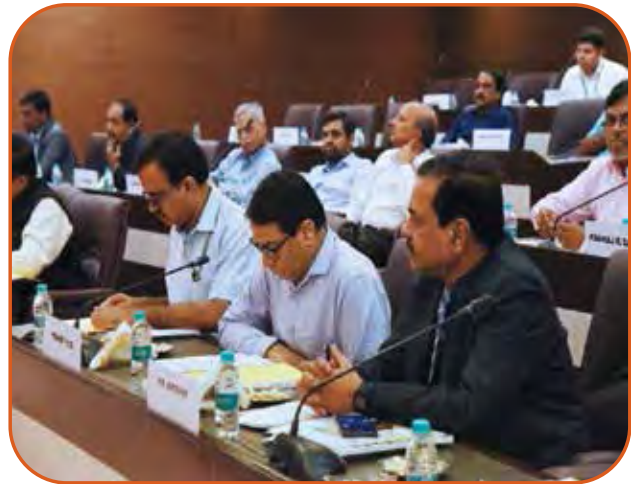
Annual General Meeting