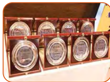
SCMS Performance Award Ceremony 2018-19

In line with same the First Annual Performance Award Ceremony was organised by SCMS on 27 th September, 2019 at R. K. Sharma Auditorium, FIMI House, Okhla, New Delhi for the outstanding performances of Training Partners, Assessment Agencies, Trainers and Assessors during the year 2018-19.