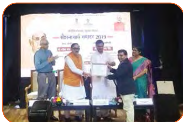
Presenting award to Trainer