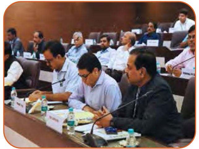
वार्षिक आम बैठक