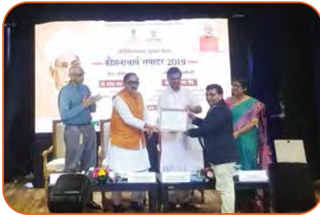
प्रशिक्षकों को पुरस्कार वितरण

5 सितंबर को शिक्षक दिवस के अवसर पर जो डॉ. सर्वपल्ली राधाकृष्णन को उनकी जयंती पर श्रद्धांजलि देने के रूप में मनाया जाता है, कौशल विकास एवं उद्यमिता मंत्रालय ने संपूर्ण कौशल पारिस्थितिकी तंत्र में प्रशिक्षकों एवं विशेषज्ञों की पहचान करने एवं उन्हें सम्मानित करने के उपलक्ष्य में एक कार्यक्रम का आयोजन किया। डॉ. महेन्द्र नाथ पाण्डे, माननीय मंत्री, कौशल विकास एवं उद्यमिता मंत्रालय विशिष्ट अतिथि के रूप में शामिल होकर इस कार्यक्रम की शोभा बढ़ाई।