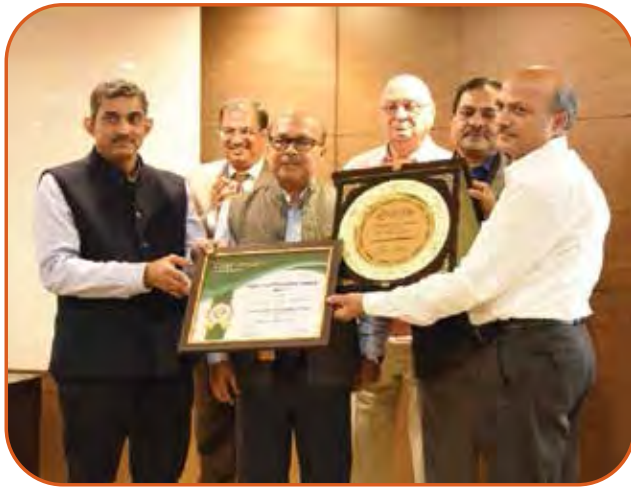
Jan Kalyan Samiti receiving the award as Best Training Partner 2018-19