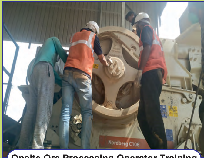
Onsite Ore Processing Operator Training

Courses We Offer Under PMKVY -We offer training under PMKVY Scheme in all job roles of SCMS