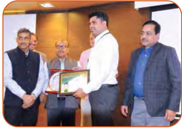
प्रशिक्षक एवं मूल्यांकनकर्ता पुरस्कार ग्रहण करते हुए