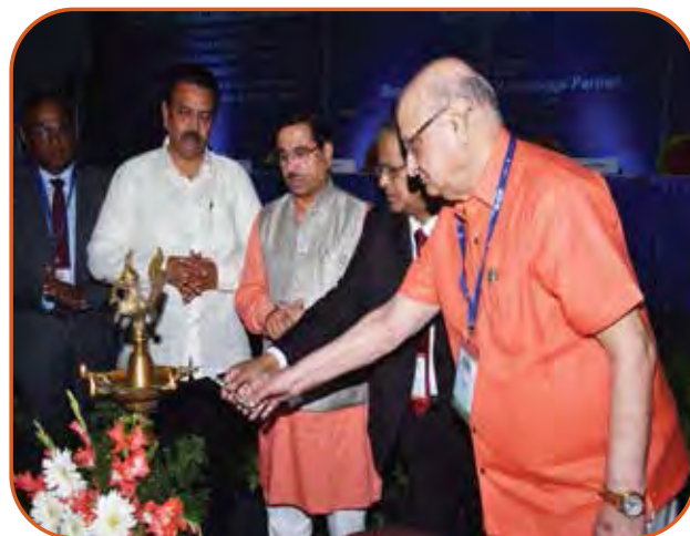
खनन मजमा, 2019 की झलक