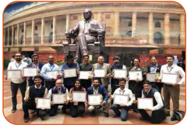
वर्ल्ड स्किल्स-2019 के लिए टीम इंडिया को प्रशिक्षित करने वाले प्रशिक्षक