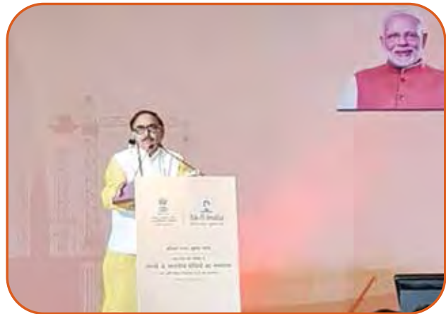
प्रशिक्षुता पखवाड़ा 2019 की झलक