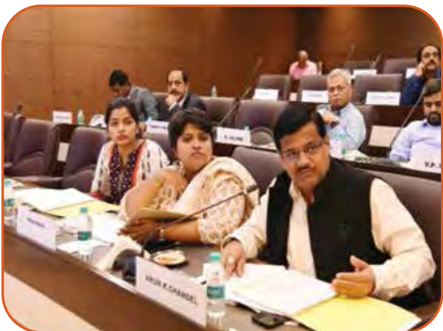
Governing Board Meeting