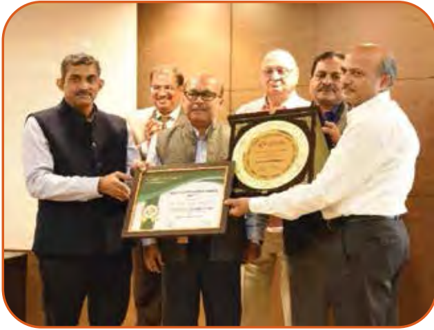
जन कल्याण समिति के सदस्य सर्वश्रेष्ठ प्रशिक्षण संस्था, 2018-19 का पुरस्कार ग्रहण करते हुए