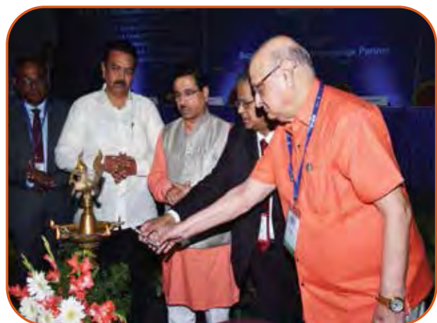
Glimpses of Mining Mazma2019