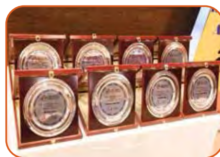
एससीएमएस कार्य-निष्पादन पुरस्कार समारोह, 2018-19

एससीएमएस कार्य-निष्पादन पुरस्कार' को संस्थागत रूप देने के फलस्वरूप एससीएमएस ने वर्ष 2018-19 में प्रशिक्षण साझेदार, मूल्यांकन एजेंसियों, प्रशिक्षकों एवं मूल्यांकनकर्ताओं के उत्कृष्ट प्रदर्शन के लिए दिनांक 27 सितंबर, 2019 को आर के शर्मा ऑडिटोरियम, एफआईएमआई (FIMI) हाउस, आखला, नई दिल्ली में प्रथम वार्षिक कार्य-निष्पादन पुरस्कार समारोह का आयोजन किया।