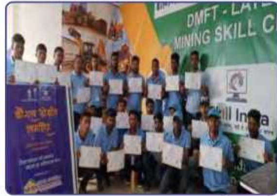
Vishwakarma puja cum convocation ceremony was celebrated on 17 th September at centre