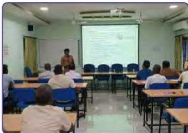
Training at NLCIL

Skill Council for Mining Sector (SCMS) has commenced RPL training cum certification of 180 regular and contractual employees of NLC India Ltd. on 22nd July, 2022. The common job roles were Mine Electrician, Mine Welder, Bulldozer Operator, Driver Special Vehicle, Dumper/ Tipper Operator & Backhoe Loader. The program is currently going on.