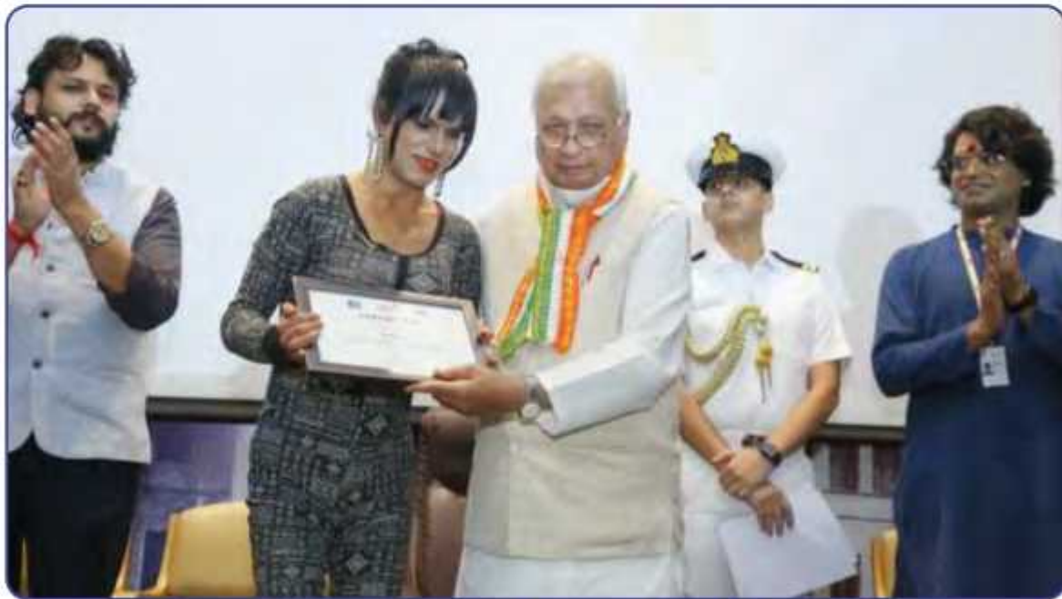
Hon'ble Governor of Kerala - Sh. Arif Mohammed Khan during the Felicitation function org. by Just Learn India