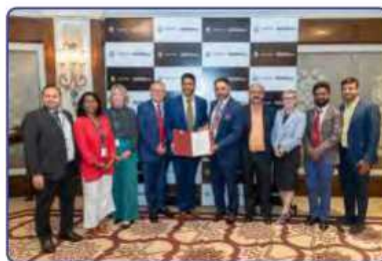
MoU signing between SCMS & Phoenix in the presence of Delegates