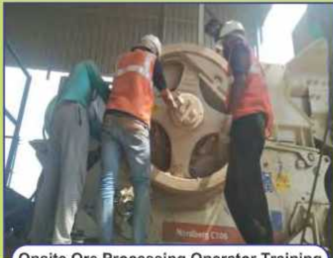
Onsite Ore Processing Operator Training

Courses We Offer Under PMKVY -We offer training under PMKVY Scheme in all job roles of SCMS