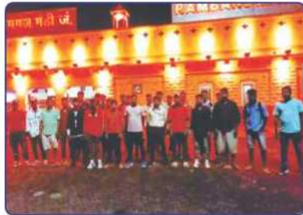
Trainees enroute to Jalawar for OJT/placement