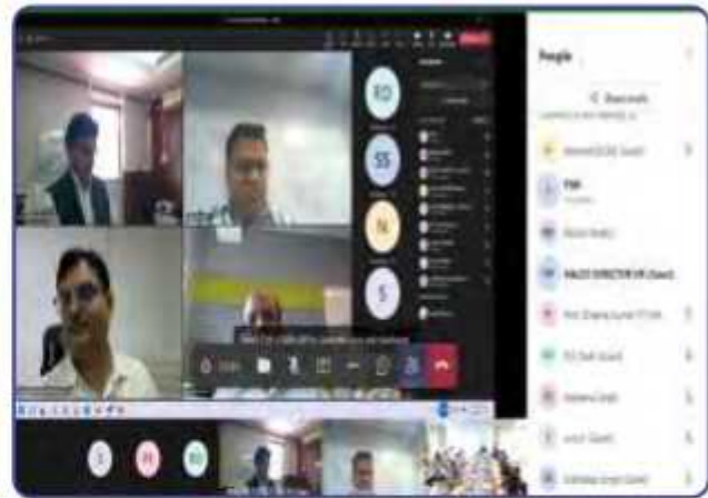
GB Meeting in progress