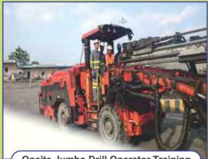
Onsite Jumbo Drill Operator Training

IISD Indian Institute of Skill Development