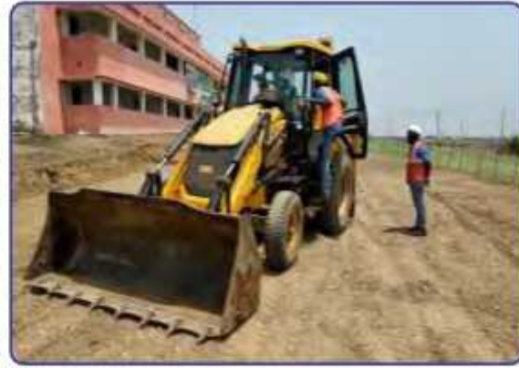
Glimpses of Training