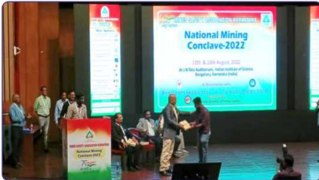
Glimpse of National Mining Conclave - 2022

SCMS presented a technical paper on "Need for Skill Training in Mining Sector" which was highly appreciated.