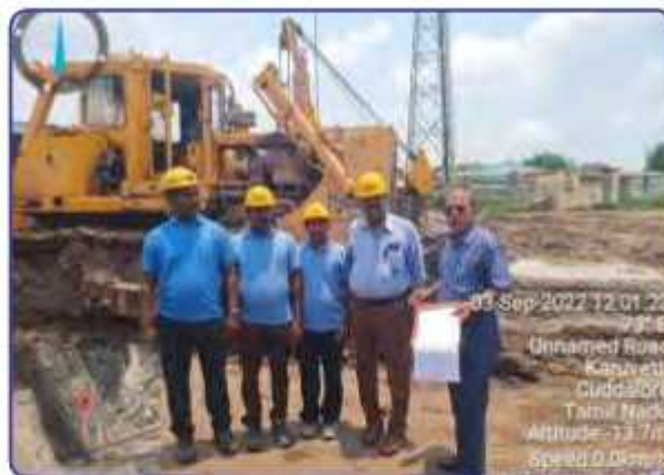
Assessment at NLCIL