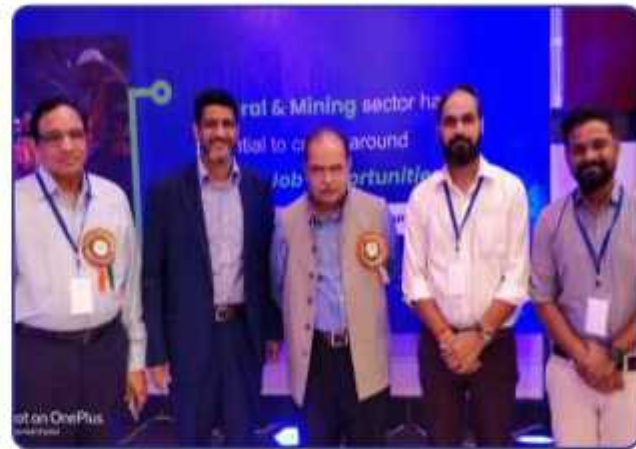
SCMS team with few of the delegates