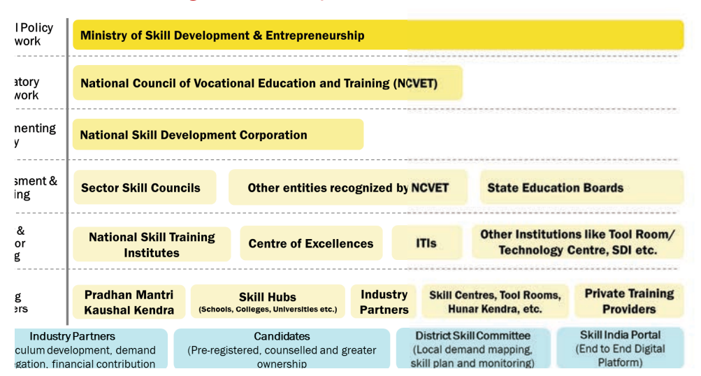
Figure 2: Broad Implementation Framework

7.1 Skill India Digital (SID) is a platform which will bring whole of government approach to skilling. As a unified registry framework, it shall enable smooth transition from education to skilling and future opportunities. SID will form the backbone for implementation of PMKVY 4.0 by providing end-to-end digitalization of training lifecycle (Registration to Post Certification Tracking).