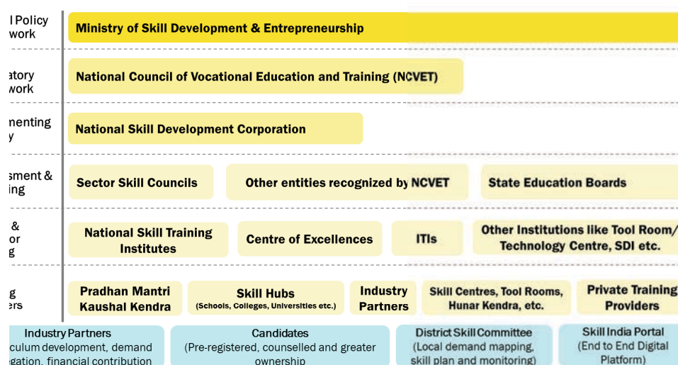
Figure 2: Broad Implementation Framework

7.1 Skill India Digital (SID) is a platform which will bring whole of government approach to skilling. As a unified registry framework, it shall enable smooth transition from education to skilling and future opportunities. SID will form the backbone for implementation of PMKVY 4.0 by providing end-to-end digitalization of training lifecycle (Registration to Post Certification Tracking).